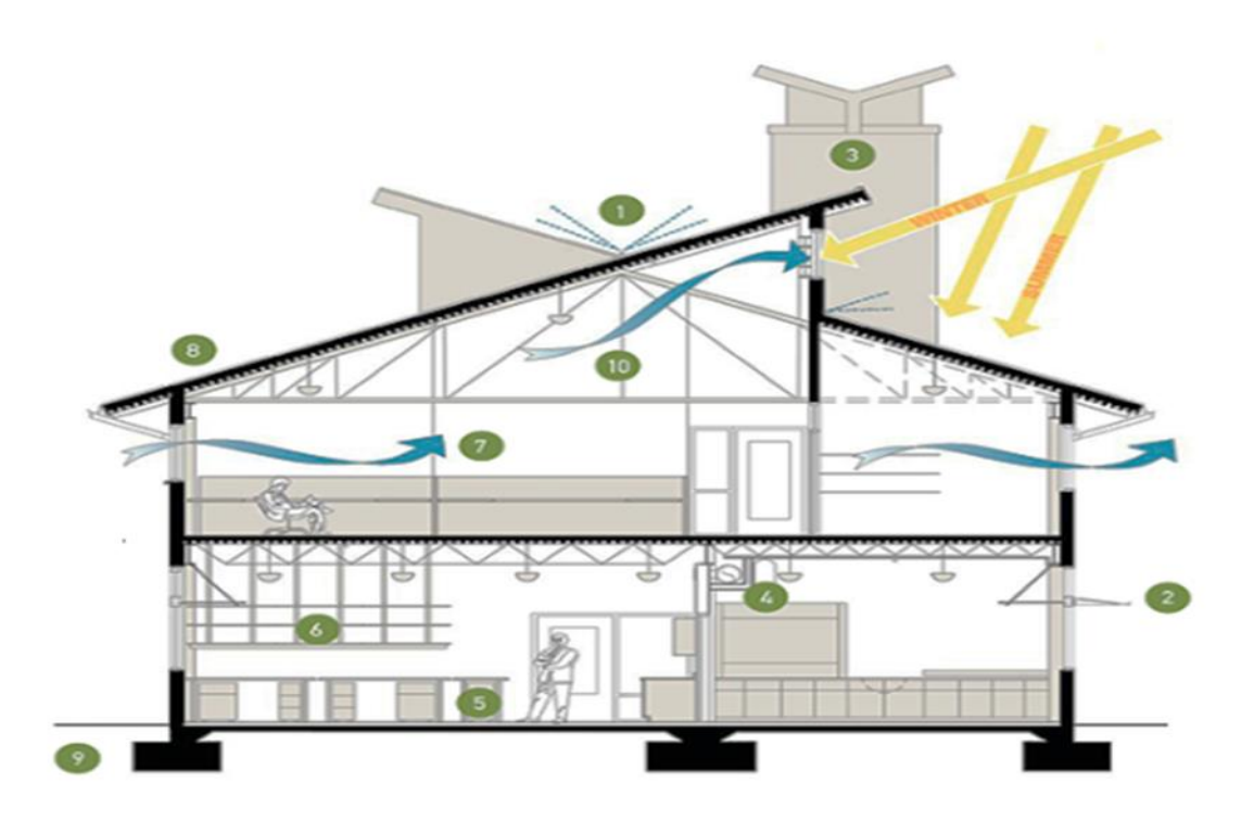
Fig. 1. Home Plans for Energy Efficiency (1- night sky radiant cooling 2- Sunshades 3- Cool lower 4- Heat recovery 5- Heating and Cooling 6- light shelves 7- Naturally top floor 8- Selective Roofing 9- Water detentions 10- lighting control).