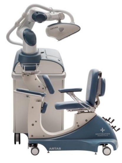
Fig. 2. ARTAS robotic [14]

An innovative robotics tool called the ARTAS Robotic Hair Transplant System is intended to automate and enhance hair restoration procedures (See Figure 2) [13]. It carefully extracts and implants hair follicles into balding areas of the scalp using specialized equipment and a robotic arm. The device can automate the follicle harvesting procedures, scan and map the scalp, and produce 3D images of the repaired hairline. Traditional surgery is not necessary with the ARTAS system because it is regarded to be less invasive. It is safe to use on men with dark, straight hair, according to the FDA. With the use of an artificial intelligence algorithm and a high-definition stereoscopic vision system, the system can recognize and choose the ideal hair follicles for transplantation [15].