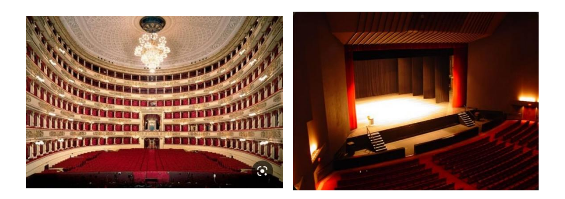
Fig, 2. Open Halls of the Theater https://masteremergencyarchitecture.uic.es/2018/01/17/socio-spatial-workshop-with-casa-bloc-refugees-in-barcelona/