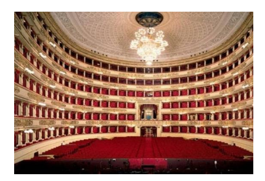
Fig, 1. shows, Teatro alla scala, https://masteremergencyarchitecture.uic.es/2018/01/17/socio-spatial-workshop-with-casa-bloc-refugees-in-barcelona/

In 2002, the theater was closed for renovations commissioned by the Swiss architect Mario Botta, and in the meantime, performances were being held at the Degali Archimboldi Theater, which is four and a half milesfrom the city center. Controversy erupted, for fear of losing historical details in this building, but operagoers said they liked the improvements and sound techniques.